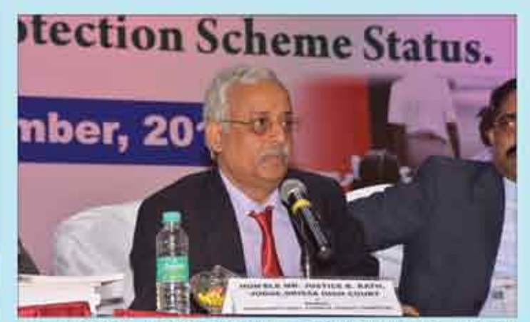
HON'BLE SHRI JUSTICE B. RATH, MEMBER JUVENILE JUSTICE COMMITTEE WHILE REVIEWING RECOMMENDATION OF REGIONAL JUVNEILE JUSTICE CONSULTATIONS