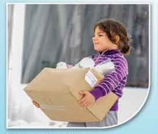
Let the Child Learn, not Earn.