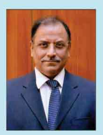
Hon'ble Shri Justice K. S. Jhaveri Chief Justice, Orissa High Court

CHIEF JUSTICE RESIDENCE Cantonment Road, Cuttack-753 001 Phone : (0671)2507808 (O) 2301703, 2301505 (R) Fax : (0671) 2301703 (R) (0671) 2508446 (O)