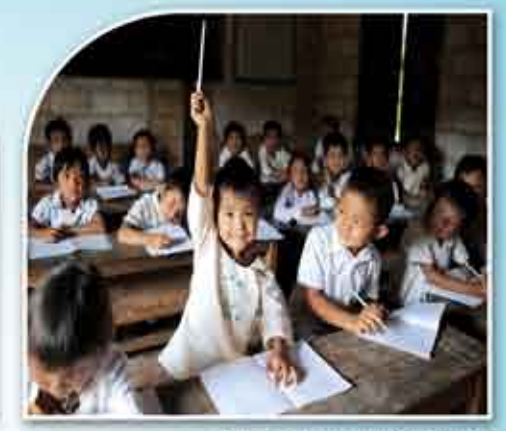
Time to shape up Little Minds