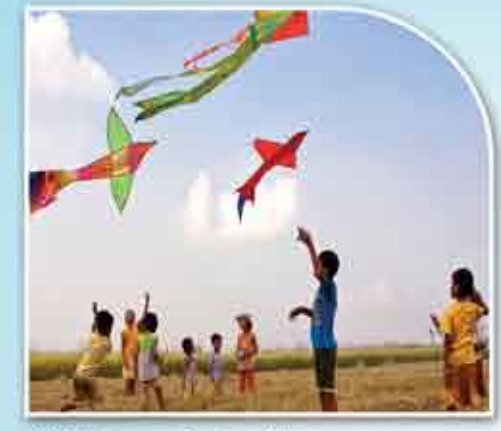
A Child deserves Freedom & Love