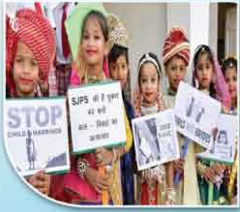
My Childhood, My Dignity.