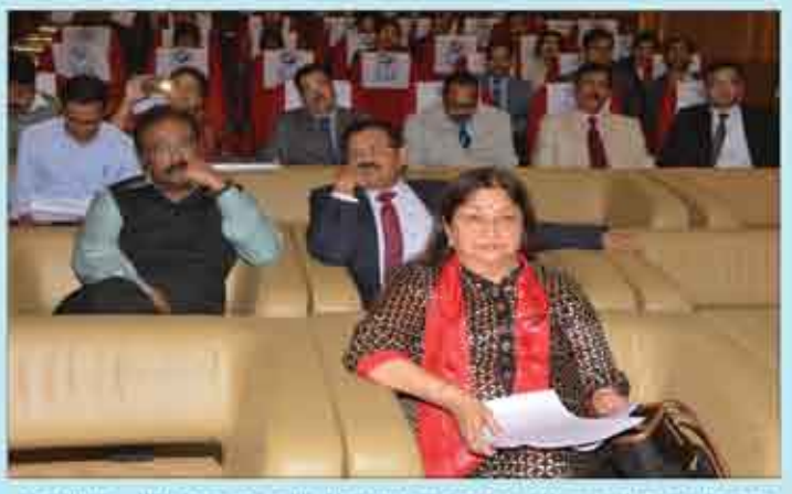
HON'BLE JUDGES OF THE HON'BLE COURT AND OTHER GUESTS