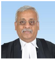
Justice B. Rath