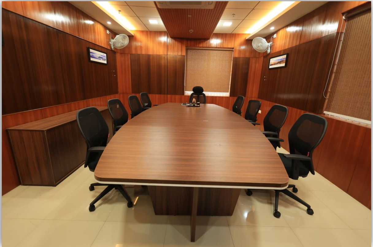
A state-of-the-art Mediation room at the Centre