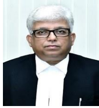
Justice S. Talapatra