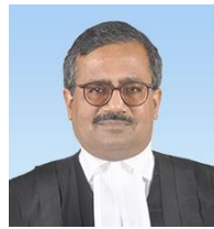
Justice K.R. Mohapatra