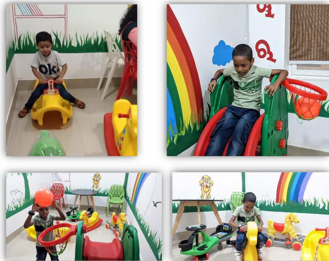
Children playing in the Creche at the Centre

to pure drinking water facility, the Centre also has got a pantry used for serving tea and snacks to the mediators, advocates, parties and other people visiting the Centre. Apart from the two lifts inside the building, there is one capsule lift fitted on the facade of the building which helps the elderly and persons with difficulty in movement, to avoid the stairs to reach the lifts inside the building. To reduce the use of papers and for the convenience of the parties and advocates in getting access to the files and records, all the disposed of and pending files in the Centre have been digitized.