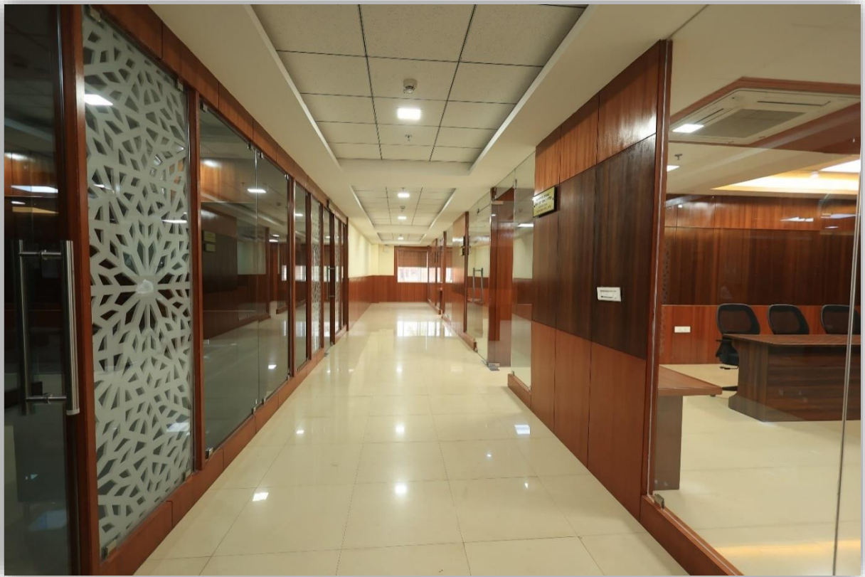
A corridor of the Mediation Centre