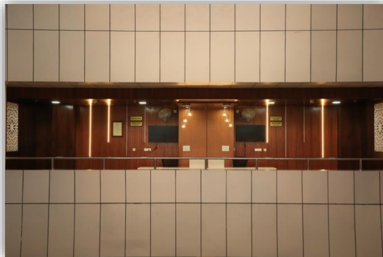
Reception area of the two wings of the Mediation Centre